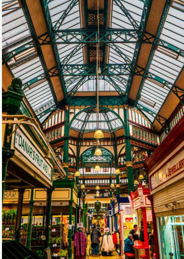
Leeds Kirkgate Market

Housed in the stylish Headrow House, Ox Club is known for its wood-fired cooking and locally sourced ingredients. The menu changes with the seasons, but signature dishes like coal-roasted meats, inventive vegetarian plates