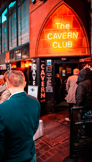
The Cavern Club