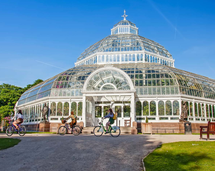
The Palm House in Sefton Park

world. Throughout the year, it hosts concerts, yoga sessions and art exhibitions, making it both a cultural venue and a peaceful retreat. Families can enjoy the playgrounds, and walkers can take in the stunning natural scenery. Unsurprisingly, Sefton Park is a favourite spot for both locals and tourists.