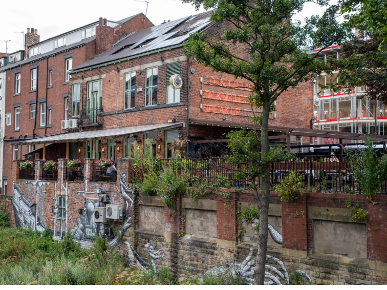
The Riverside pub in Kelham Island Marketing Sheffield

Sheffield vibe. With a packed programme of gigs, DJ sets and exhibitions, it's the kind of place where you might stumble upon the next big thing. The venue spills over multiple levels, from a moody basement stage to a courtyard beer garden, and its proud DIY spirit makes it a favourite among Sheffield's indie crowd.